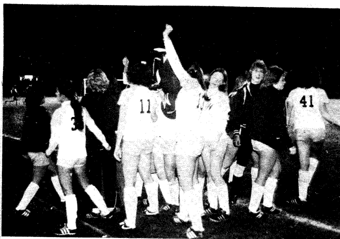
TEAM SPIRIT was high last Saturday night when the Wayne girls' soccer team faced Pittsford-Sutherland in the finals of the Sectionals, but the Eagles were downed by a 3-0 score to lose their chance for a Class B title. The game was played at Spencerport.