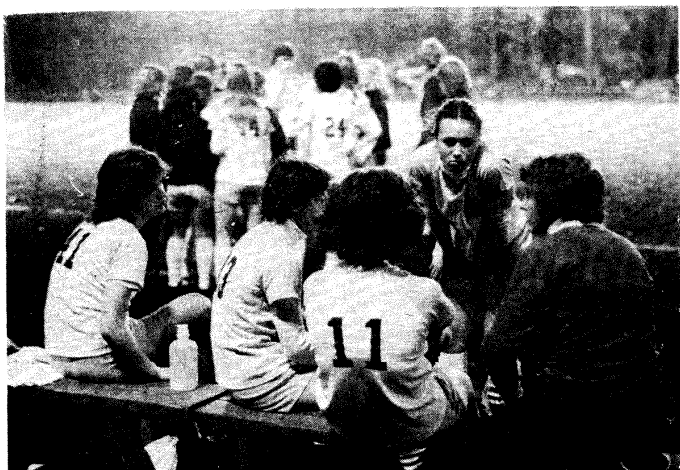
GAME STRATEGY is discussed by Wayne Central's girls' Eagles at the soccer Sectional game against Pittsford-Sutherland last Saturday night. Wayne lost 3-10, but it was the first local girls' team to go to the finals in the Sectionals.