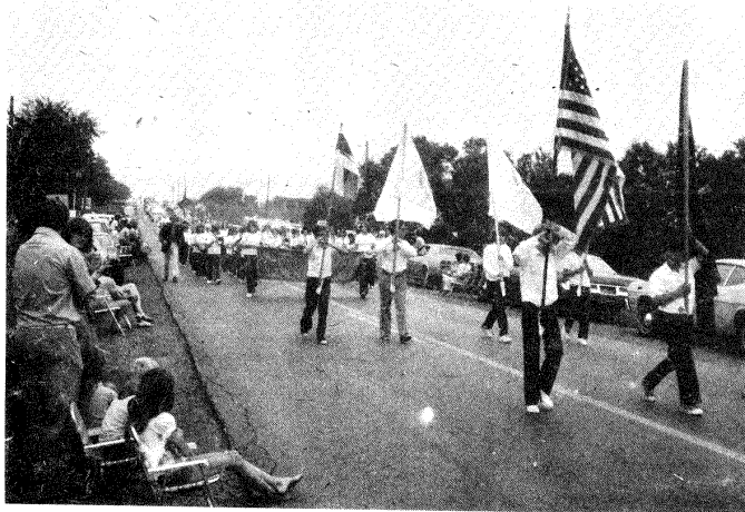
THE WALWORTH-FREEWILL - Elementary Band, representing the combined musical talents of both schools, marched in Saturday's Walworth Bicentennial Parade.